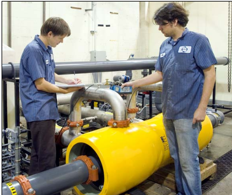
Figure 3 – ERI Titan PX-1200 Energy Recovery Device on Test Stand

The Titan PX-1200 is built into a standard 16-inch diameter, 1200-psi membrane pressure vessel. The unit contains a single cartridge in which pressure exchange occurs. The cartridge includes a ceramic rotor and two ceramic endcovers. The Titan device was designed to operate at flow rates up to 273 m 3 /hr or 1,200 gpm. Its efficiency performance on ERI's test stand is summarized and compared to that of the PX-220 is given in Figure 4. The efficiency data in Figure 4 is plotted as a function of fractional flow which is the measured flow rate divided by the maximum rated flow of the device. For example, a PX-220 operating at 220 gallons per minute is operating at a fractional flow of 1.0.