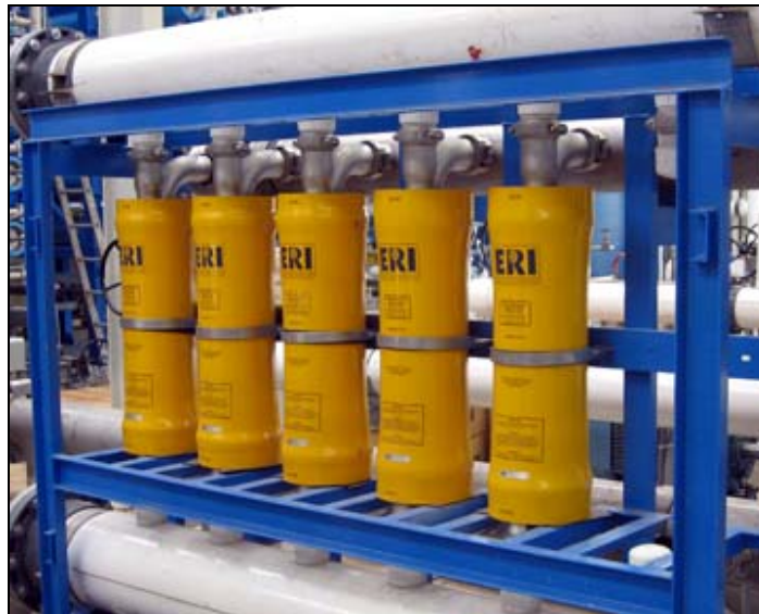
Figure 1 – PX-220 Energy Recovery Device Array

The plant is equipped with four sets of five model PX-220 pressure exchanger devices. Each group of five devices are mounted on manifolds to operate in parallel. A photo a PX device array at the plant is shown in Figure 1.